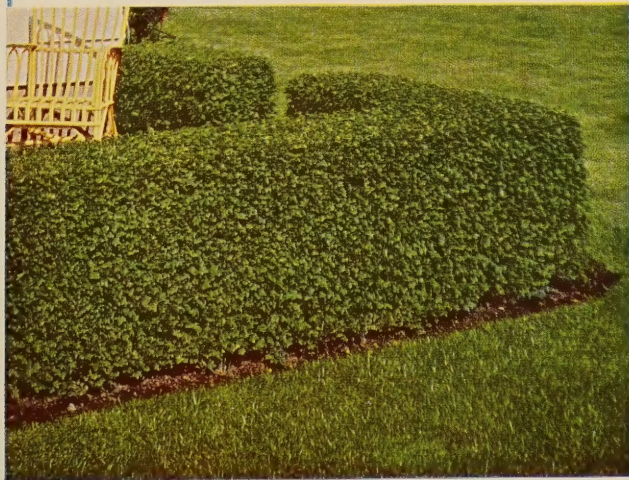
Evergreen Chinese Privet